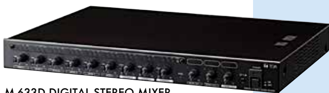
M-633D DIGITAL STEREO MIXER

For those who require superior sound quality with easy, one-touch operation in a single-purpose venue